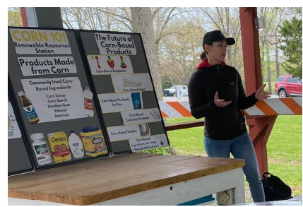
Monroe County Conservation Day, April 2022

Learning resources for K12 students and teachers remained top of mind throughout Fiscal Year 2022. As COVID restrictions began to lift and local schools started hosting visitors again, NCERC was present at multiple studentfocused events and showcased the opportunities for careers in the bioeconomy.