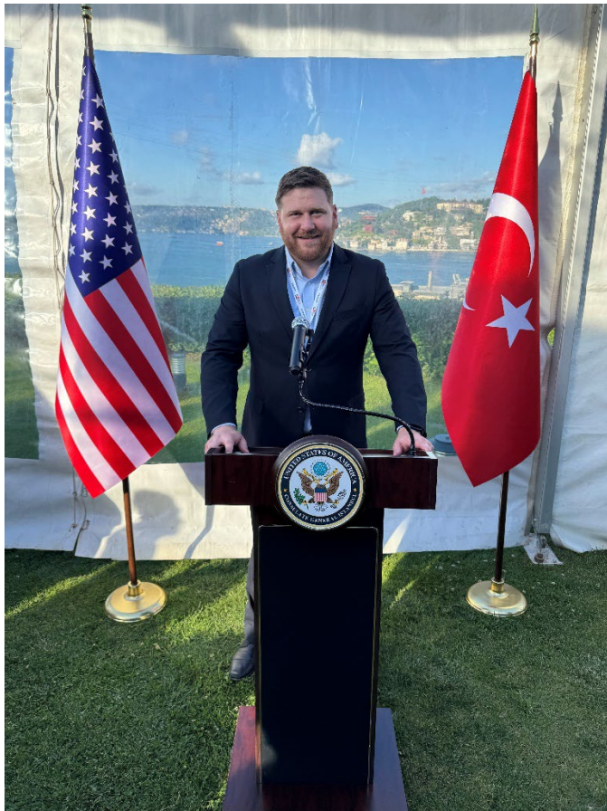
Trade Winds 2024, Türkiye. May 13 -15